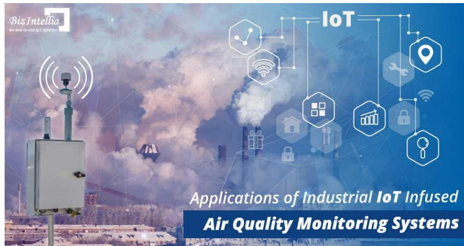
Fig 1: Air Quality Monitoring Architecture

present around industry it also checks high pollution rate and compare it with standard levels and when quality goes down beyond a certain level it sends notification to human that it's not safe. Existing System only uses arduino controller, two sensors MQ6 and MQ135. For output it uses LCD (Liquid Crystal Display). Due to rapid development in technology, the development material for little and low cost sensors became technically and economically feasible. Particular attention is given to factors which can affect human health and the health of the natural system. The main objective of IOT Air pollution Monitoring System is to monitor pollution levels, that is major issue these days. It's necessary to watch air quality and keep it in check for a far better future and healthy living for all. Due to flexibility and low-cost Internet of things (IoT) is getting popular day by day.