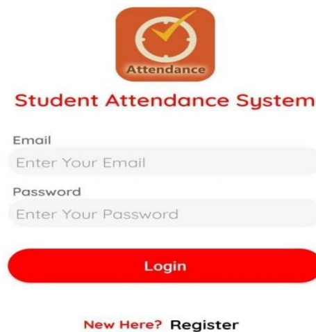
Fig 3 Students attendance system

There are three types of user's i.e Administrator, Reporter and guider. Any user who wants to use the attendance system must have user name & password which admin can grants it. So it confirms that it is a authorized user Attendance system have mainly three parts, i.e first part is admin session part , where one can login to system and edit on all database tables. The second part is that the instructor session, where one can login to system for marking attendance and third part is reporter session, that also login to system where attendance can be viewed as well as report all these tasks. When user open the system login page will show . It consists of three types mainly Text fields, button and labels. The Two text fields for username and password.