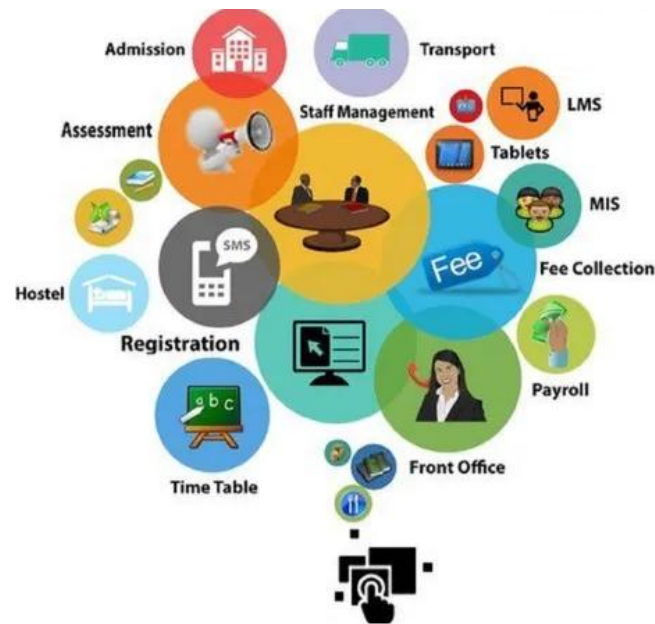
Fig 1 Smart application for students