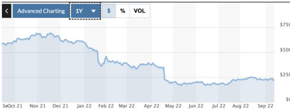
Fig 1. The stock price of the Netflix

The numbers above show how Netflix's total membership in the US has grown from 20.19 million in '67 to over 20.21 million in '75. As you can see from the financial data above, Netflix has managed to increase the number of paying members, as well as the rate paid per member. In fact, the average monthly revenue per member grew from $2019 in 12.57 years to $2021 in 14.56 years. This suggests that the platform is currently sticky enough for paying members to stay, even as prices rise. Therefore, churn, a key metric for a subscription-based platform, is stable enough to allow Netflix to achieve sustained revenue growth.