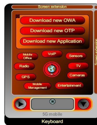
FIG.1. 5G Mobile Phone Concept